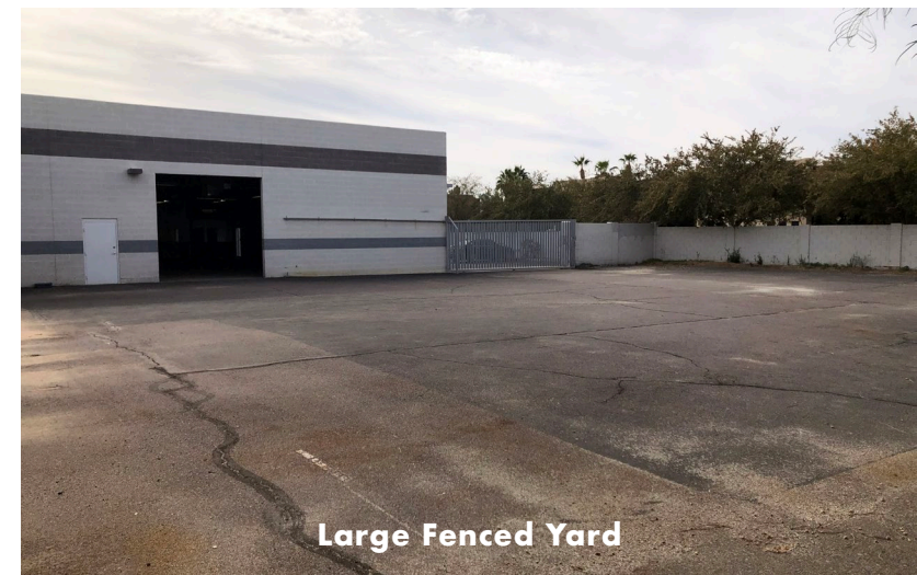
Large Fenced Yard

8767 E. Via de Ventura Suite 290 Scottsdale, AZ 85258 RGcre.com